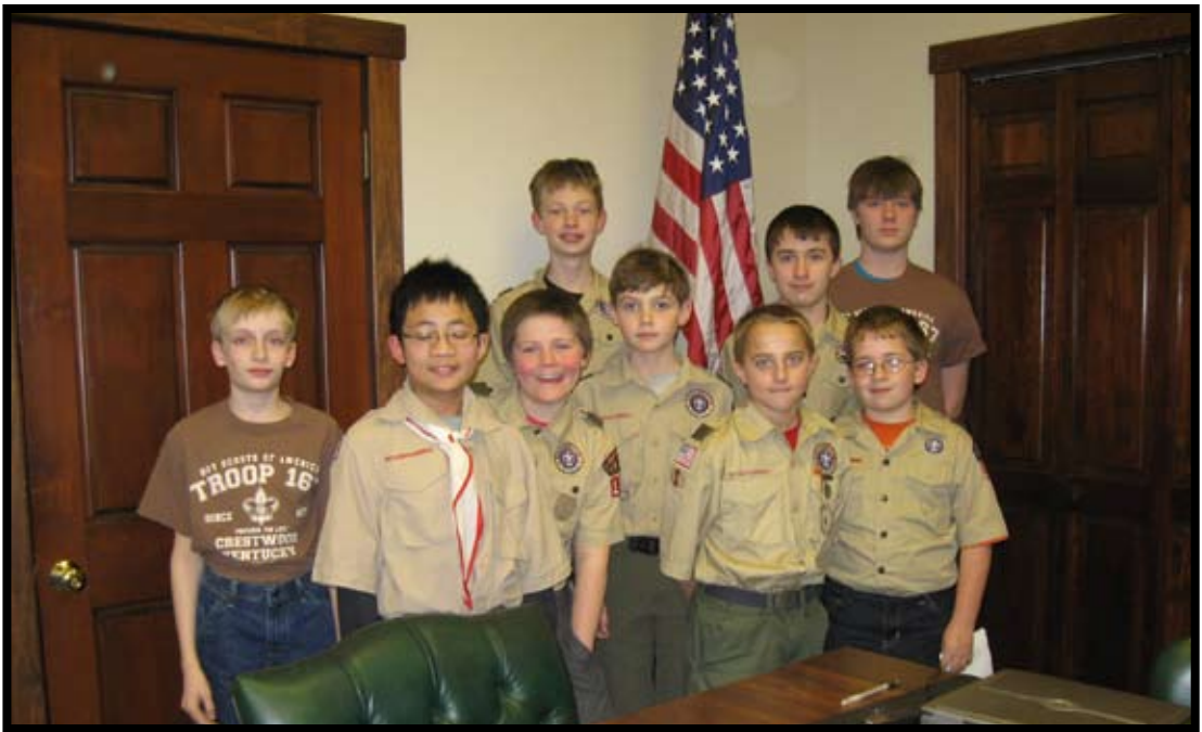
Boy Scout Troop 167 from the Crestwood United Methodist Church sat in on a recent Town Council Meeting.