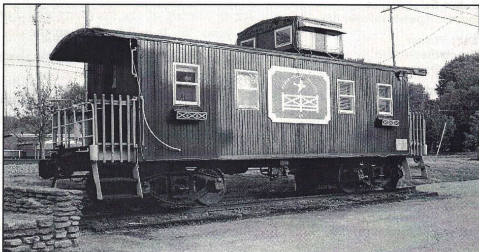
The Red Train Caboose in Pewee Valley.

We hope to add features and historical stories in future issues. We welcome your ideas and suggestions.